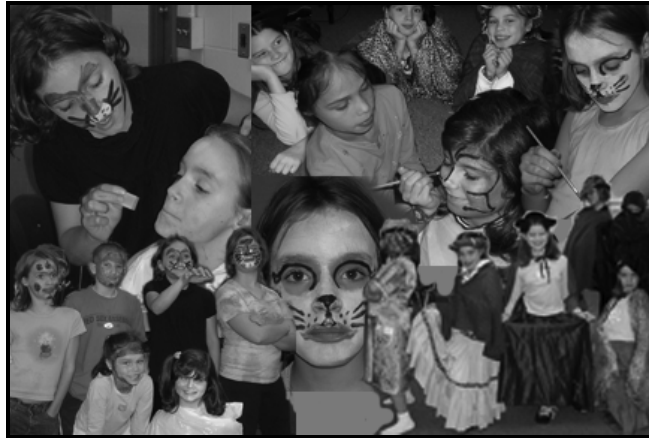
Ossipee students experiment with face-painting and costumes

At the end of the classes the students took home theater books, which were created by the students and the director during the course. The theater books contain information about all aspects of theater arts, with photographs of the participants designing their own costumes, painting their faces for stage work, and working with props and masks for the various activities. The participants reported that the Perform It! After School Program was not only fun, but that it also taught them a lot about theater arts, Shakespeare, and history. They especially liked the games and hands-on activities. They signed each other's books during the last class, which gave them not only an educational tool to keep, but also a photo album of the work they accomplished.